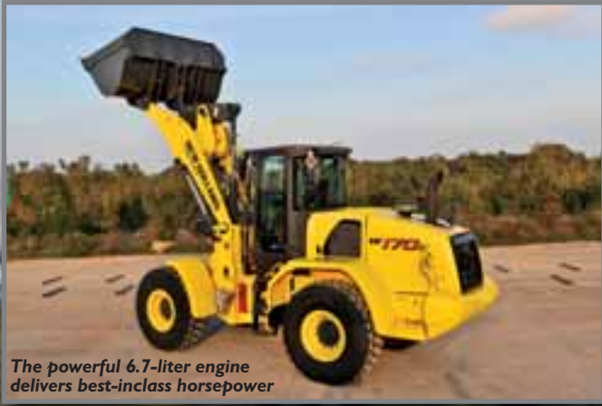
The powerful 6.7-liter engine delivers best-in-class horsepower

The 4.75 cubic yard W230C wheel loader launches a new size-class for New Holland. Offering more net horsepower, greater tipping load weight and bucket breakout force, the W230C meets aggregate stockpiling and other highproduction truck loading applications head on.